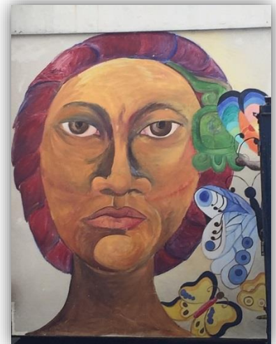
Mural in Guatemala City