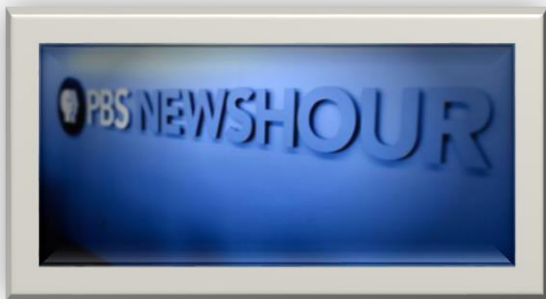
"Inside the 'Pure Hell' of Honduras's Rising Tide of Domestic Violence" aired October 24 & 25, 2015