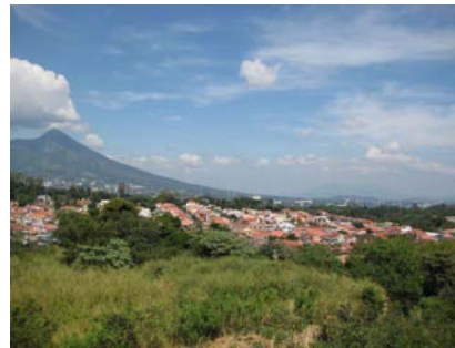
The peaceful landscape of El Salvador

In 1996, El Salvador enacted a law against intra-familial violence to address the alarming frequency and brutality of the beating, rape, and murder of women, often perpetrated by their own family members. More recently, the Salvadoran Legislative Assembly enacted two additional laws, to address violence against women (2010) and equality for women (2011).