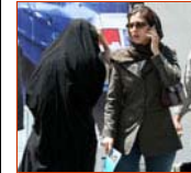
Women and Islam