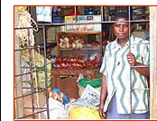
Rule of Law in Africa